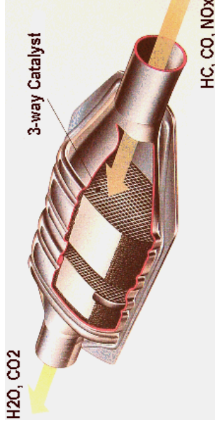
Example of an automotive catalytic converter.

Hbar Power, LLC maintains the copyright for this brochure. © 2008 (All rights reserved)