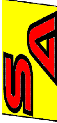
Smog Avenger™ is a division of Hbar Power, LLC

Hbar Power, LLC maintains the copyright for this brochure. © 2008 (All rights reserved)